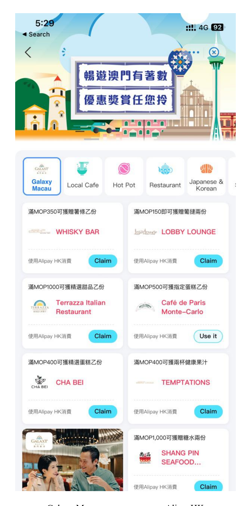
Galaxy Macau coupon zone on AlipayHK